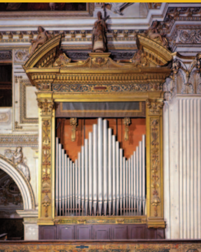
Vegezzi Bossi Organ 1915 Ruffatti 1948