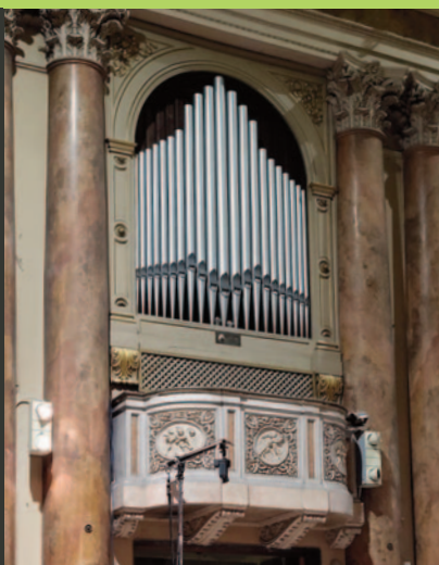
XVII century Organ by Anonymus